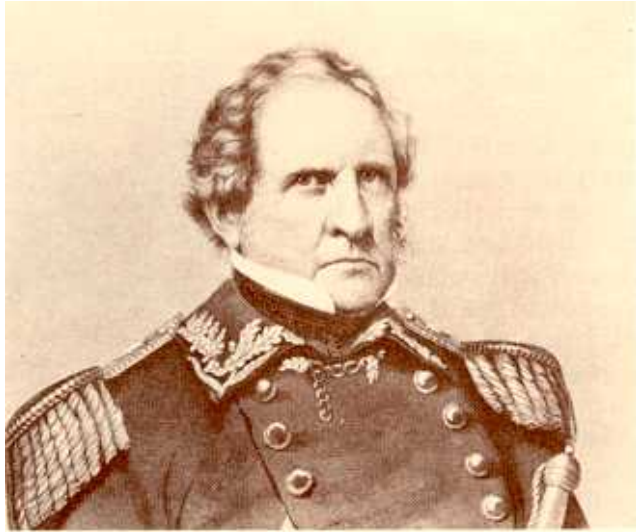
Brigadier General Winfield Scott

fighting. When Scott's brigade appeared, the British charged. To their astonishment the Americans did not break and scatter but fought back with courage and skill. It was the British line that broke and retreated across the Chippawa.