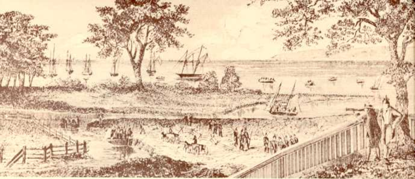
Landing of General Harrison's Troops at Buffalo Creek, October 1813.

The Niagara River flows north for about thirty miles from Lake Erie to Lake Ontario. For most of its length it runs through flat and fertile country. It can be crossed by small boats for all but seven or eight miles near the Falls. This fact was of great military importance during the war years. The peninsula between the lakes was a transferring point for food and supplies from one lake to the other.