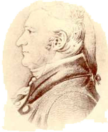
Major General Henry Dearborn.