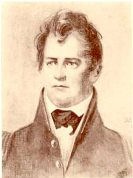
General Peter B. Porter.

determined to conquer the continent of Europe and to subdue England as well. England was fighting for self-preservation. Neither Napoleon nor the British Government had much concern for the rights of a weak neutral, such as the United States was at that time.