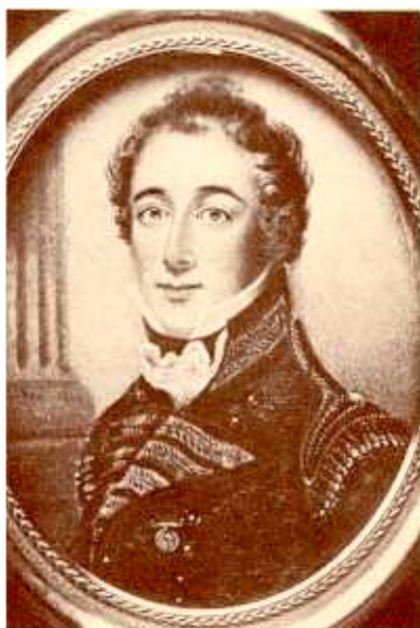
British General Sir Isaac Brock.

Van Rensselaer's troops had arrived on the Canadian side, and many more were in position to cross. Victory appeared to lie in American hands.