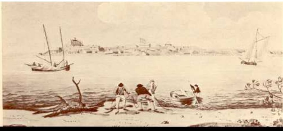
Fort Niagara, about 1803, as viewed from Fort George.

Further American crossings were opposed by the British battery at Vrooman's Point firing at boats crossing the river. However, it did not do much damage. By 2 o'clock in the afternoon some 700 or 800 of