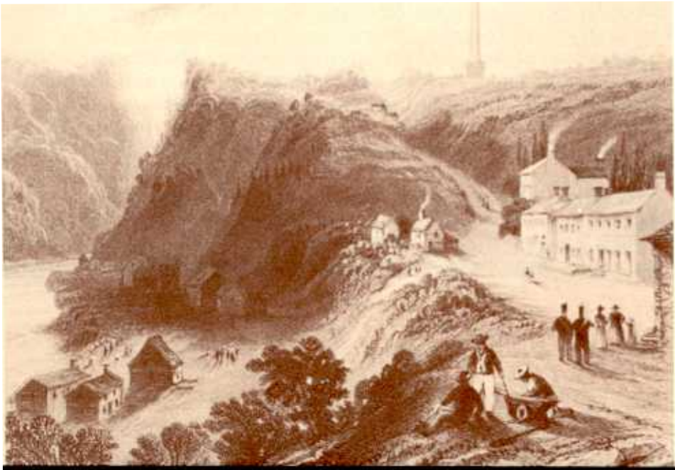
Queenston Heights showing Brock's Monument, as it appeared in 1840.

On the night of June 5, some 1,400 of the American troops camped on the Burlington-Niagara Road near the mouth of Stoney Creek on Lake Ontario. Lieutenant-Colonel Harvey, under Vincent's command, led a surprise attack on the American forces and drove them out