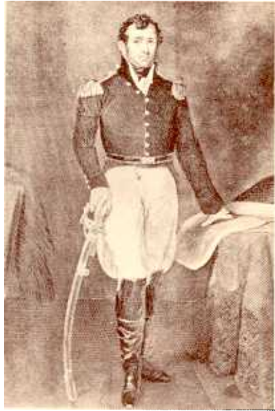
Major General Jacob Brown.

General Riall, leading a force of British Regulars and Indians, made a stand on the south bank of the Chippawa River near the Niagara. The field was open and level, an ideal battleground for traditional