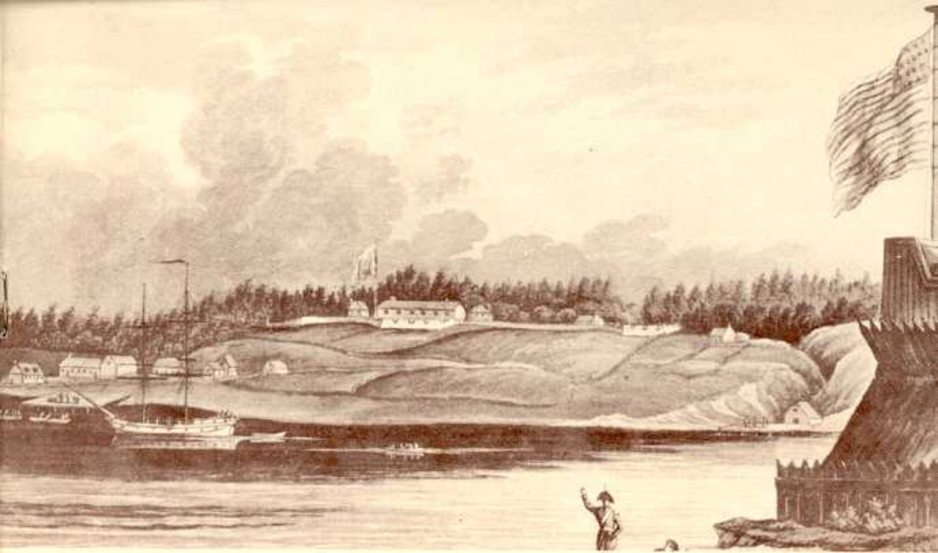
A view of Fort George, Upper Canada, from Fort Niagara —1812. American flag can be seen flying from Fort Niagara.

allies. Their mere presence with the enemy had a demoralizing effect on the poorly-disciplined American troops. This was not all due to imagination, for the Indians frequently demonstrated their ideas of how to treat fallen foes. The British, however sincerely they tried, could not always persuade them to abide by the niceties of “civilized warfare.”