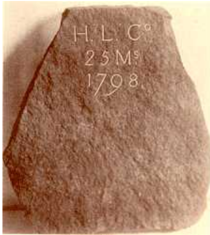
Stone Marker on Transit Line Now in Buffalo and Erie County Historical Society.

marked out. The townships were divided into lots of 320 acres each. Where necessary, these lots were subdivided into 120 acre tracts. It was a trying task, even for the most courageous person.