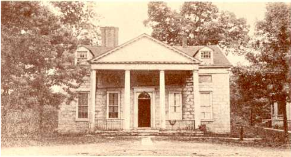
"The Old Holland House" --- Office of the Holland Land Company, erected 1806, now Holland Purchase Museum, Batavia, New York.

The situation began to improve after 1808 with the growth of trade across Lake Ontario to Montreal. Porter, Barton & Co. developed a transportation business to by-pass the Falls by the old Indian portage which eased the problem of shipping goods out of the Buffalo-to-Lewiston area. But this was little help to the earliest settlers nor to those who lived in the southern part of the Purchase. The marketing difficulties were not satisfactorily solved until the construction of the Erie Canal.