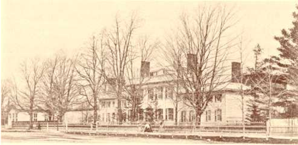
Ellicott Mansion — Batavia, New York, built 1822.

lots. According to the state law, the land of non-residents was not subject to road tax. No wonder that the residents complained and requested the legislature to tax these lands.