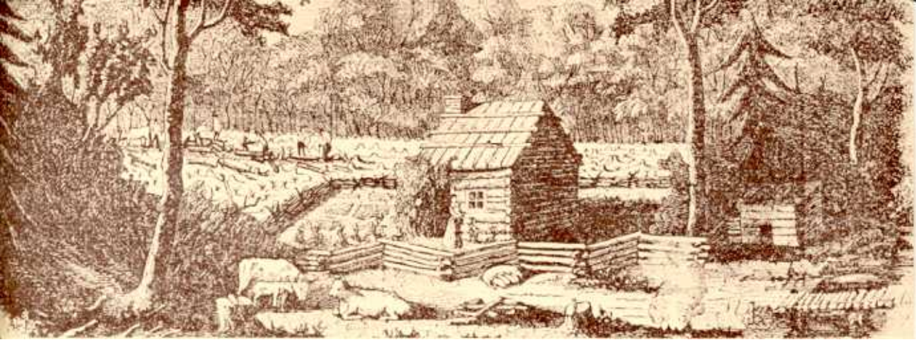
Typical early settler's home on the Holland Land Purchase.