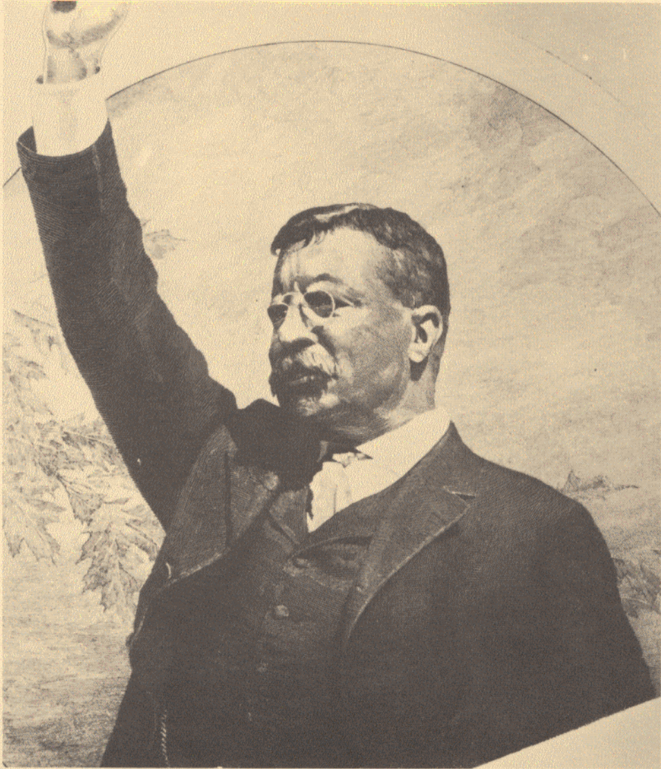
President Roosevelt in a characteristic pose. His philosophy of "Speak softly, but carry a big stick" left a lasting impact upon the history of the United States and the world.