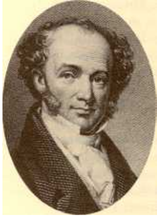
Martin Van Buren