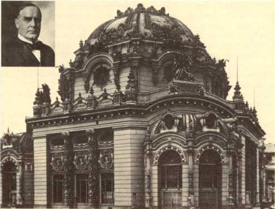
The Temple of Music where President William McKinley was shot while attending the Pan-American Exposition.

The people of Buffalo will always have a special interest in the presidency of Theodore Roosevelt, because it was in this city that the awful tragedy occurred which made him President . . . .