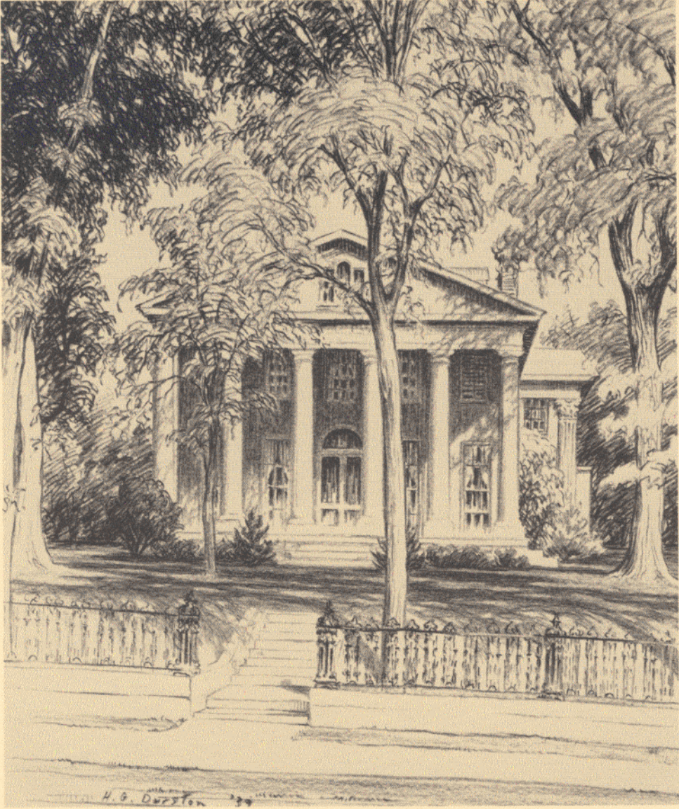
The Helen Durston drawing of 1939 showing the front view of the Wilcox house as it appeared at that time.