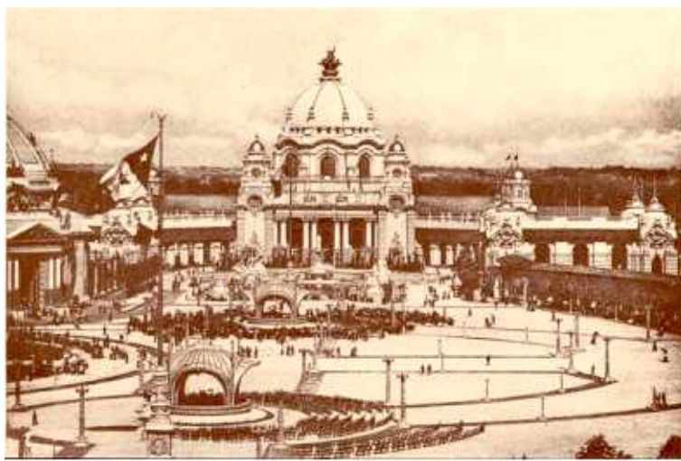
Esplanade and U. S. Government building.

The weather was almost perfect. A crowd of 20,000 people attended these opening ceremonies. The cost of admission was 50 cents a person. Sunday's fee was finally cut to 25 cents because The Midway was closed on Sundays under great pressure from religious groups.