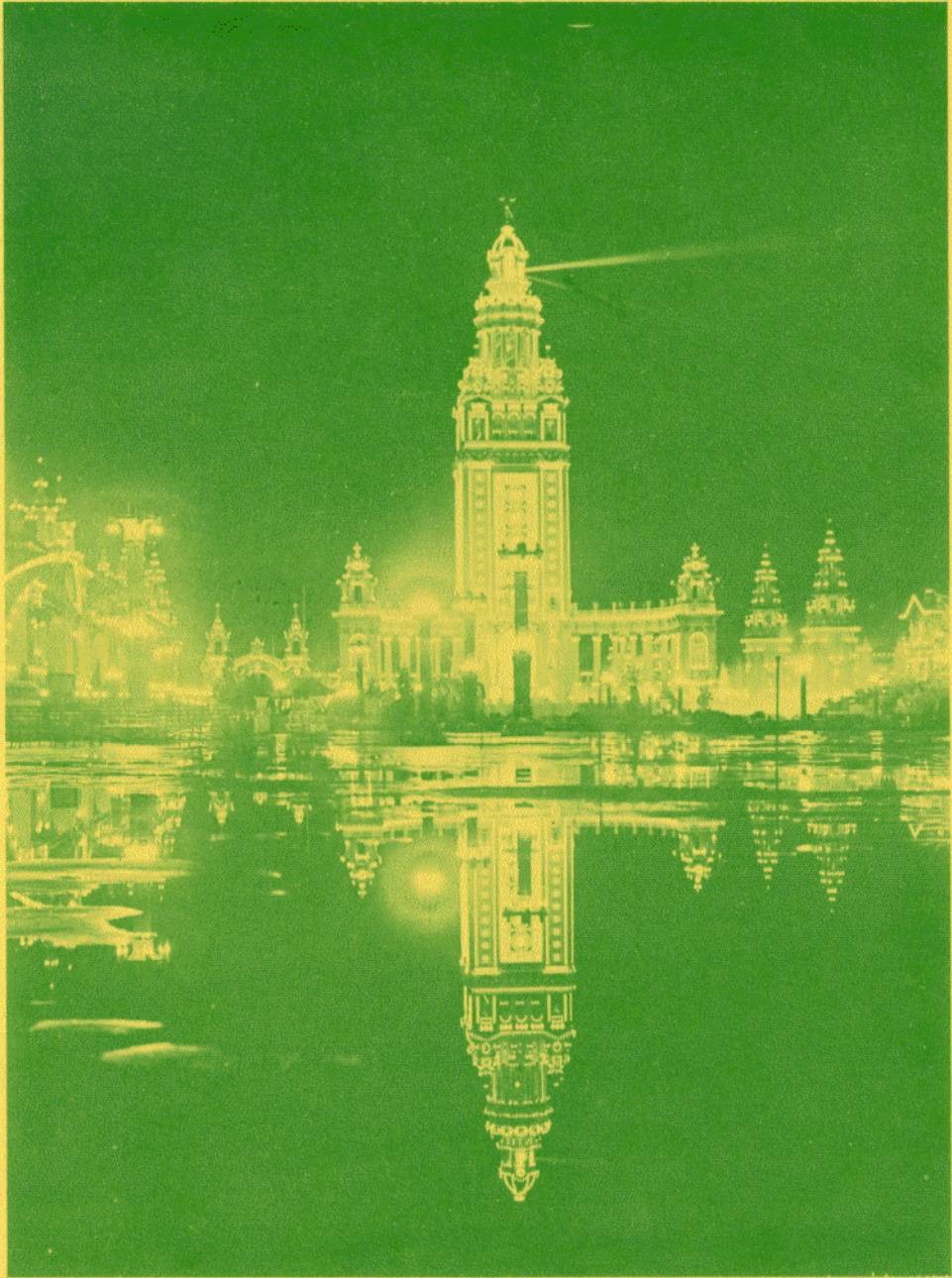
Electric Tower at night reflected in flooded grounds after downpour in July, 1901.