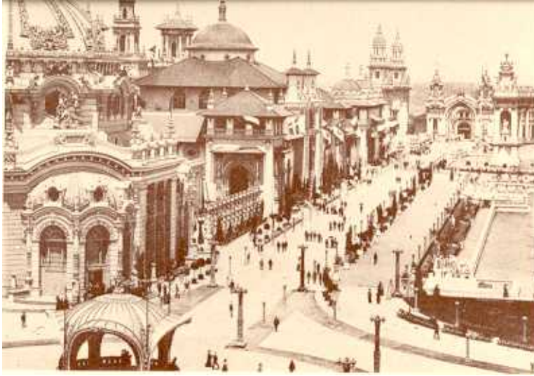
A "Street" at the Exposition.

Everything, however, was not ideal at the Exposition. In the early stages very unseasonable weather had delayed the workmen for days at a time. Labor disputes and strikes slowed down building construction schedules. Many out-of-town people postponed visiting the Exposition until after July 1 because of a rumor that the fair could not possibly be completed before June 15. However, these adverse conditions did not dull the enthusiasm and expectations of the crowds. On the contrary, excitement ran high. All who attended the Exposition were more than pleased with the results.