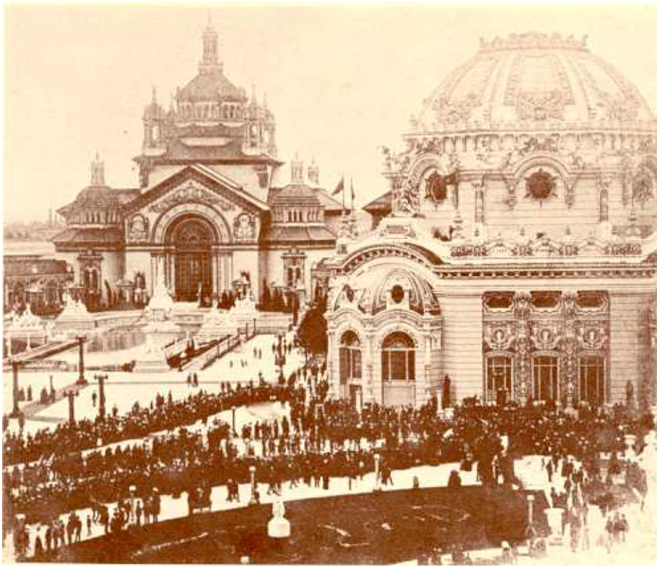
Temple of Music on Dedication Day. Horticulture Building on left.

An indirect outcome of the Exposition was the complete change in leadership of the U. S. Government. McKinley's death brought in an entirely new administration with the inauguration of Theodore Roosevelt as the new President of the United States. Not to be forgotten is the fact that Roosevelt was sworn into office right here in Buffalo.