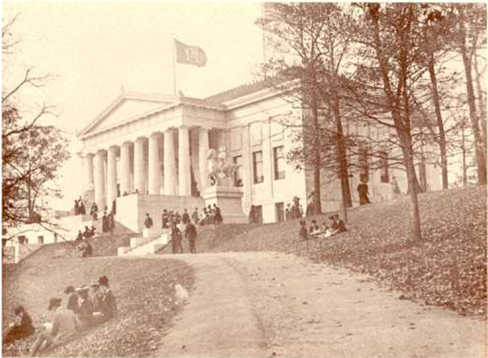
New York State Building — now Buffalo and Erie County Historical Society.