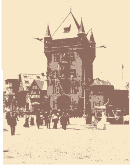
Alt Nurnberg — one of the Exposition Restaurants.

Many parts of the Midway are educational. Whole villages are set up with real natives living in them. They use the same implements and wear the same clothing which are characteristic of their native lands. Perhaps the Indian Congress, represented by the Iroquois, is of most interest to us. Also known as The Six Nations, the ancestors of these Indians were the primitive inhabitants of New York State.