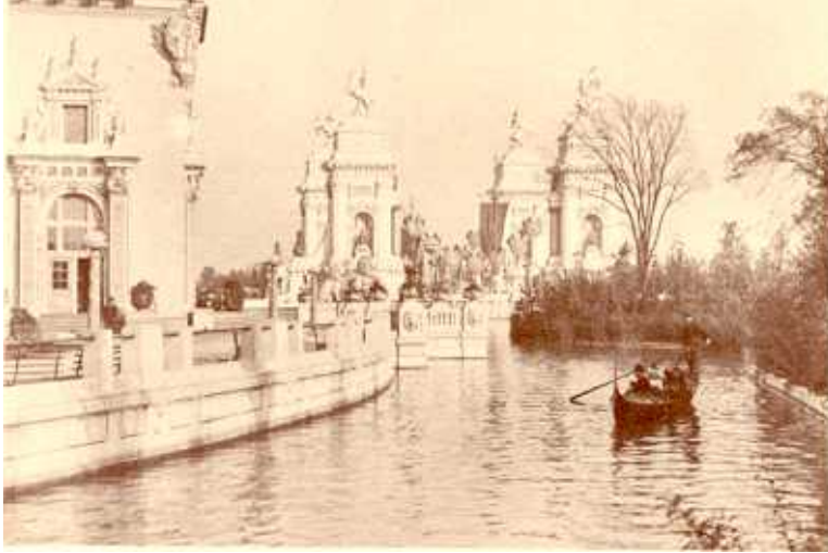
Grand Canal showing Triumphal Bridge in background.

Historical Society with the understanding that the Historical Society would use the building at its permanent headquarters after the Exposition closed. It was designed by one of Buffalo's leading architects, George Cary.