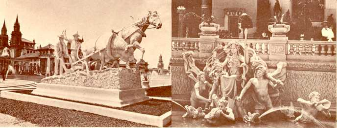
Examples of Statuary in the Exposition Grounds.

lights. As the Illustrated Buffalo Express of the day summed it up: "All recall the beginning, the raw preceding days, the rainy succeeding days, the delays, the departure of labor, the day of dedication with its speeches and songs, its statesmen and poets and preachers, its music and rejoicings. Then followed the months of merry days, of State celebrations, of national ceremonies, of club and college and social days, of flag and Army and Navy and municipal days. . . . Then came the awful tragedy, the day of death, saddest of all days." And now it was Closing Day.