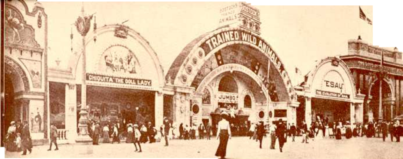
A Glimpse at the Midway.

midget who weighs 18 pounds and is only 26 inches tall. She speaks several languages, plays a tiny piano, sings, and is one of the most attractive and entertaining performers at the Exposition.