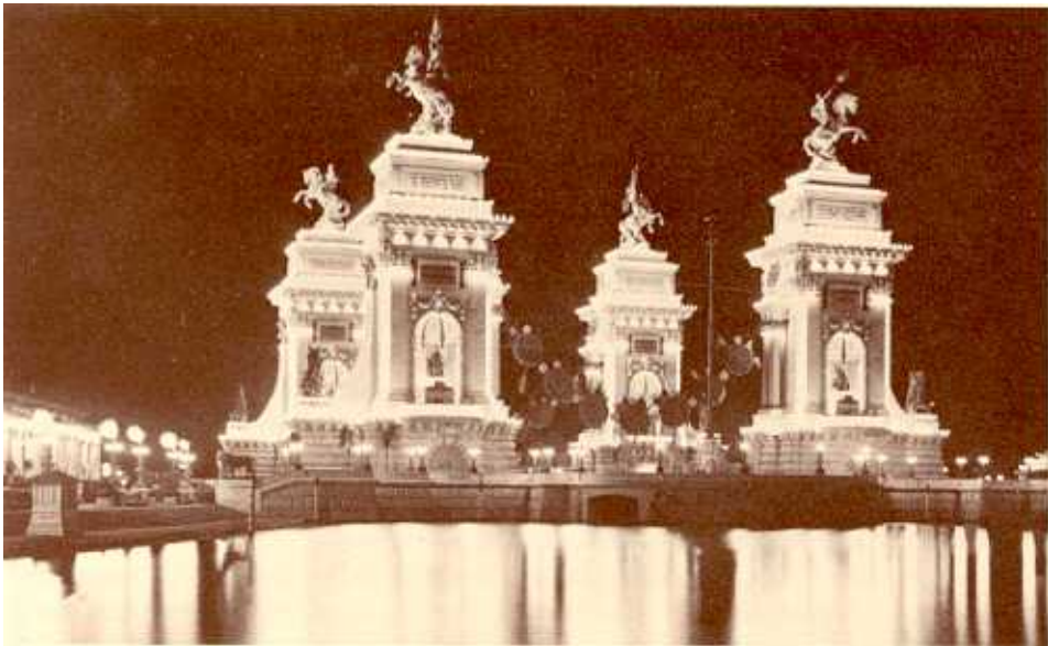
A night view of the Triumphal Bridge.

We have spent so many hours at the Exposition that it has become dark. Once again we must pay special honor to electricity, for the night time fairyland would not be possible without it. Many men