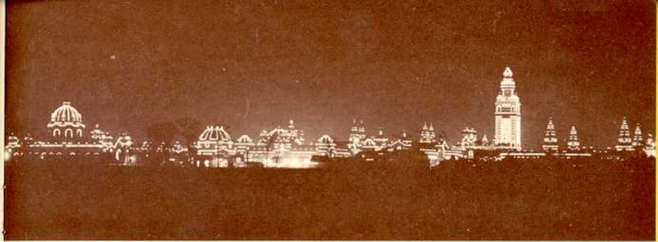
Distant view of Pan-American Exposition at night.

witnesses claim has never since been equalled in Buffalo. Nearly one inch of water fell in the early hours of the evening.